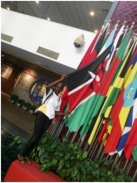
At the CI headquarters