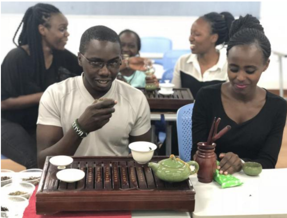
Chinese tea making

On the Chinese culture we were taught the Chinese calligraphy, sachet making, mask painting and Chinese tea making.