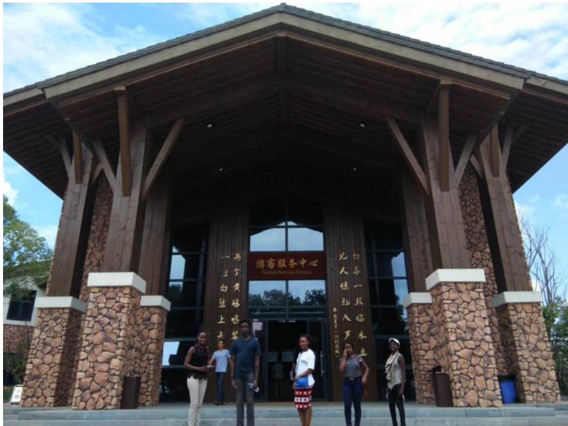
The park of love in Zhejiang province

We went for boat-riding,saw beautiful flowers,waterbucks but the most amazing thing about this park is its name. The park of love .The name is derived from a famous movie that was shoot here on 'Test for true love'.The feeling of the park is nothing but love!